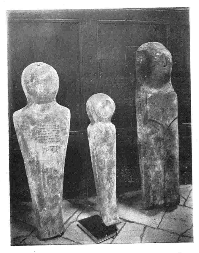
VAULT No. 2. Three Babies' Shells. Date 1657, 1671, one not dated.